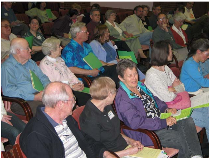
Earth Day workshop participants are learning about the environment. April 2005

Open Conversation on Issues in Faith-Based Advocacy – What are the limits to congregational advocacy and what are the philosophical implications of claiming the “moral high road” in public policy debate? This session will be a free-wheeling conversation on the Big Questions, facilitated by Rev. Clare Butterfield.