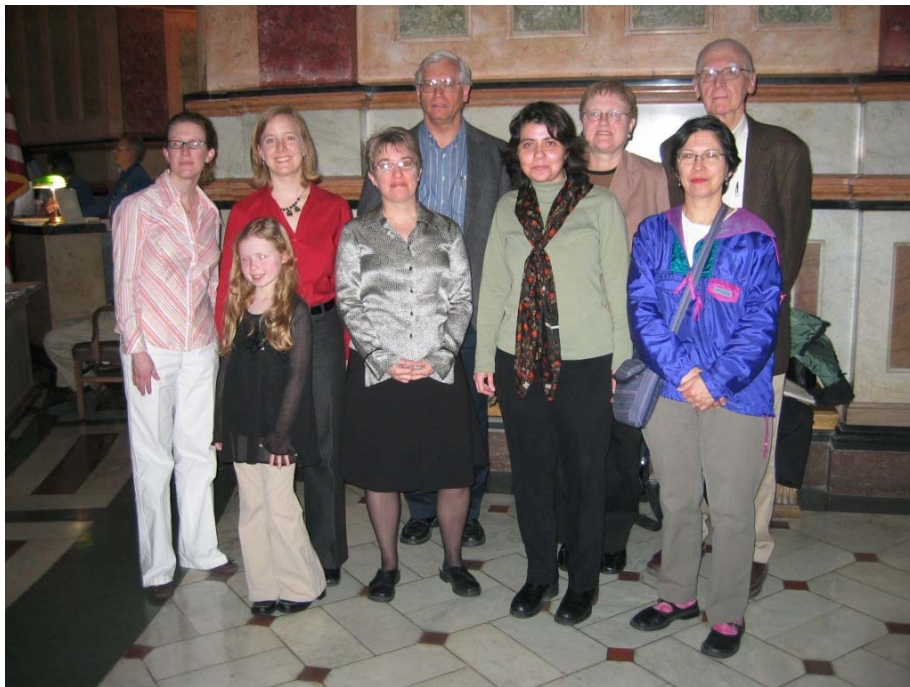
The pioneers from our first annual trip to Springfield! April 2007

Is this appropriate for children? We think so. Children younger than 8 or 9 might have trouble getting much out of the day, but older ones can really learn a lot about how our government works.